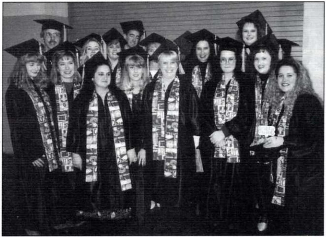
The San Juan Teaching Center graduates pause before ceremonies at the Winter Commencement in December.